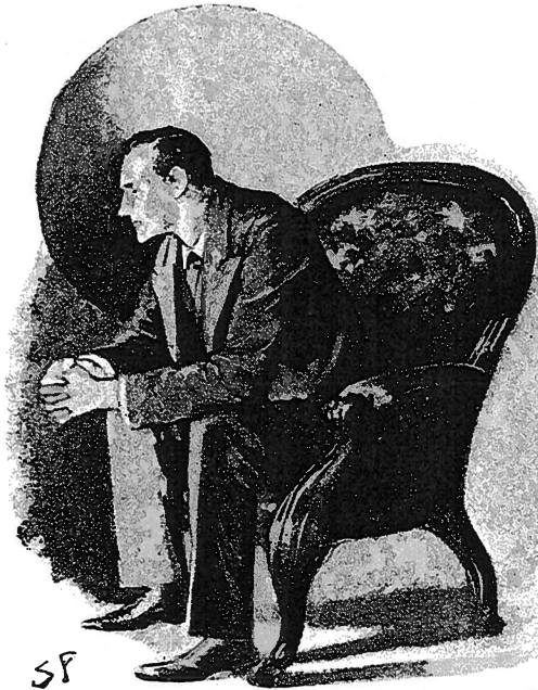
"HIS EYES BENT UPON THE GLOW OF THE FIRE."

free education and encyclopædias, is a somewhat rare accomplishment. It is not so impossible, however, that a man should possess all knowledge which is likely to be useful to him in his work, and this I have endeavoured in my case to do. If I remember rightly, you on one occasion, in the early days of our friendship, defined my limits in a very precise fashion."